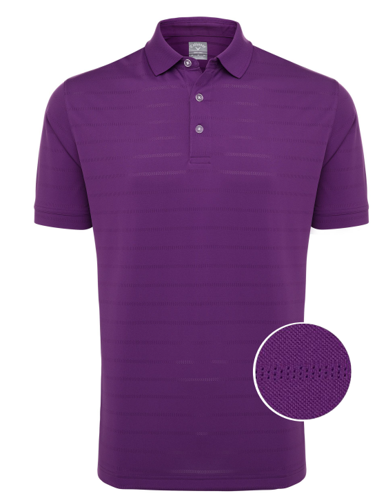
513 Purple Magic